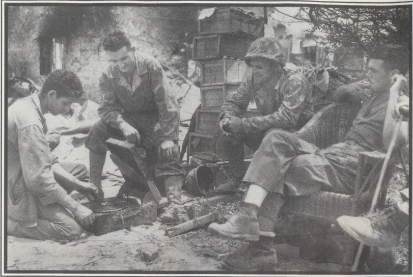
Marines in the Marianas enjoy "Pacific overtures" and equipment liberated from the Japanese in 1944.